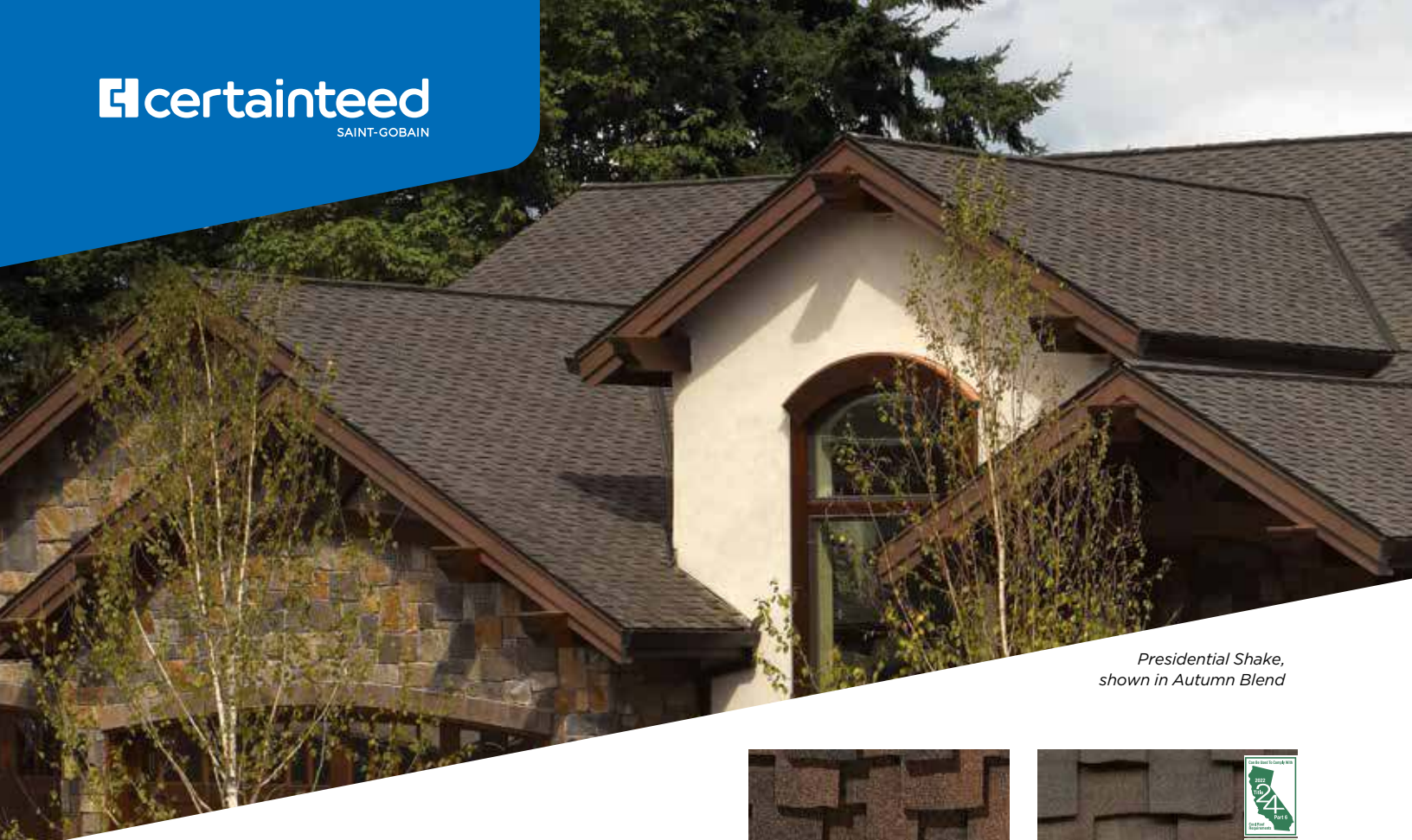
Presidential Shake, shown in Autumn Blend