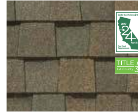
Solaris Heather Blend CRRC Product ID 0668-0117