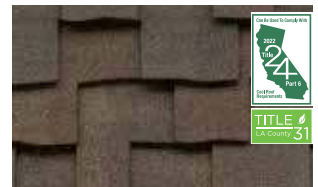
Solaris Autumn Blend CRRC Product ID 0668-0127