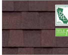
Solaris Burnt Sienna CRRC Product ID 0668-0153