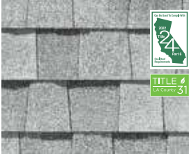
Solaris Silver Birch CRRC Product ID 0668-0072