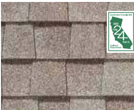
Solaris Mojave Tan CRRC Product ID 0668-0115