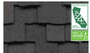
Solaris Shadow Gray CRRC Product ID 0668-0134