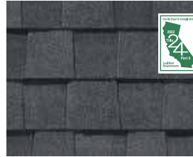
Solaris Moiré Black CRRC Product ID 0668-0129