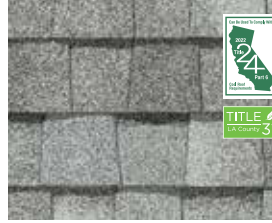
Solaris Birchwood CRRC Product ID 0668-0084