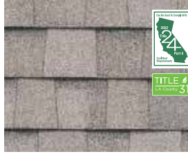
Solaris Mist White CRRC Product ID 0668-0071