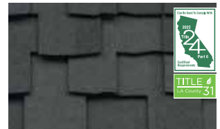
Solaris Charcoal Black CRRC Product ID 0668-0132