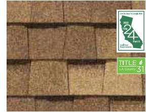
Solaris Resawn Shake CRRC Product ID 0668-0118