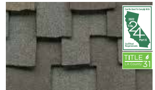
Solaris Country Gray CRRC Product ID 0668-0128