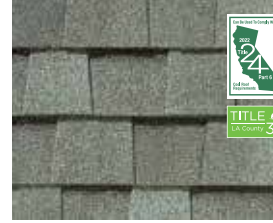
Solaris Georgetown Gray CRRC Product ID 0668-0116