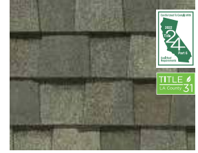
Solaris Weathered Wood CRRC Product ID 0668-0119