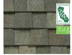
Solaris Weathered Wood CRRC Product ID 0668-0119