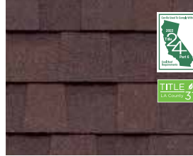
Solaris Burnt Sienna CRRC Product ID 0668-0153